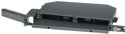
AX100042 FiberExpress (1U) Rack Mount Patch Panel