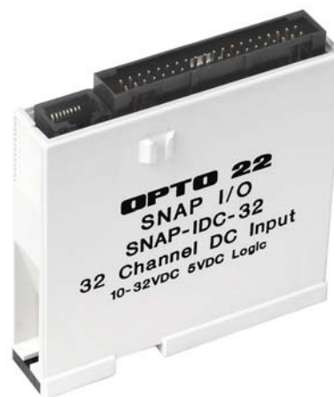
SNAP-IDC-32 high-density digital input module

All HDD input modules feature automatic counting and latching. The DC models are ideal for detecting low-voltage auxiliary contacts.