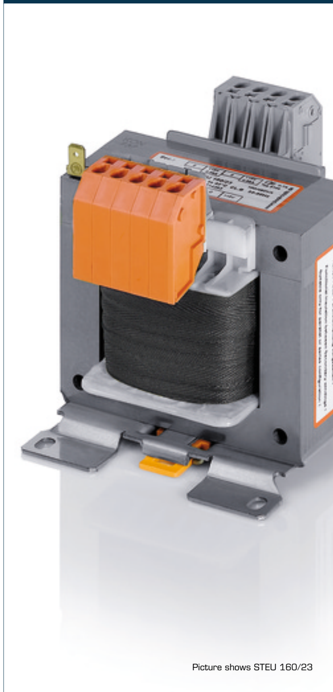
Picture shows STEU 160/23