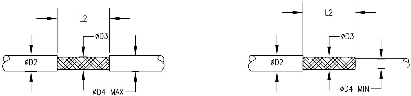
TABLE II: CABLE PREPARATION MEASUREMENTS